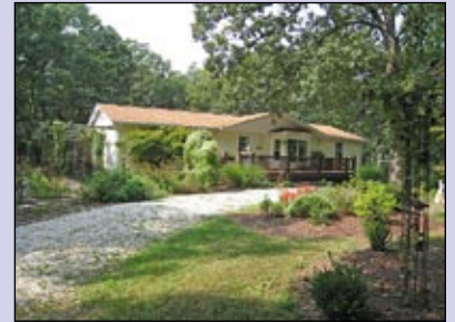
4163 HENCKEN ROAD Wildwood Home on Acreage • $310,000