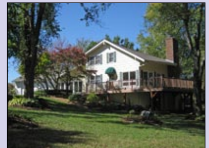
3208 OLD HIGHWAY 100 Villa Ridge Horse Property • $329,900