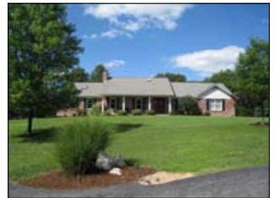
18317 ALLENTON FOREST DRIVE Wildwood Horse Potential • $473,500