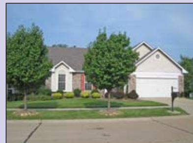
553 VISTA HILLS COURT Eureka • $279,900

Visit my website WWW.LTREALTOR.COM to view all listings