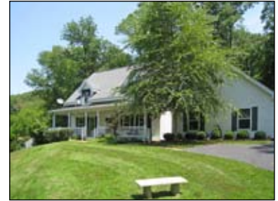
18621 WHISKEY CREEK ROAD Wildwood Horse Property • $522,025