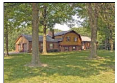
949 OLD EATHERTON ROAD Wildwood Acreage/Investment Property • $274,550