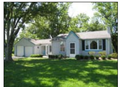
951 OLD EATHERTON ROAD Wildwood Acreage/Investment Property • $198,550