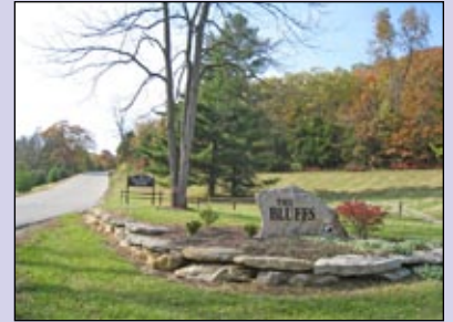
3540 HAWTHORNE RIDGE DRIVE 4.9 Acre Lot in Eureka • $98,000