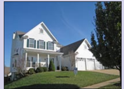
306 OXFORD RIDGE COURT Wildwood • $392,500