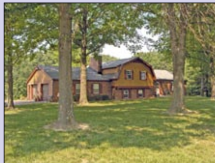
949 OLD EATHERTON ROAD