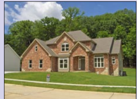
773 SOUTHERN HILLS DRIVE

A wonderful investment opportunity in Wildwood! 3.5 parklike acres available with adjoining property for only $499,900!